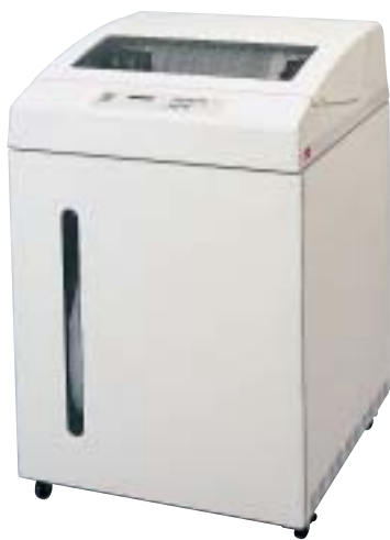
Dot-line Printer KD50A