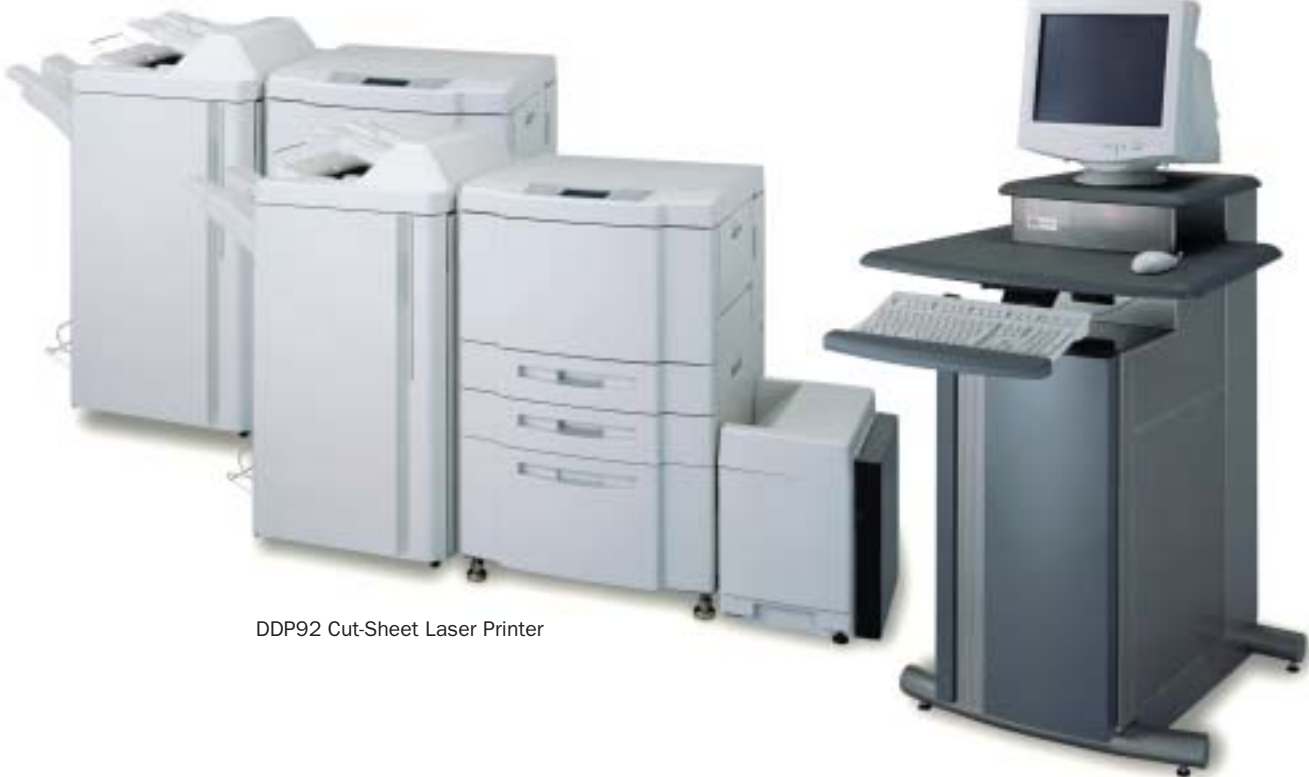
DDP92 Cut-Sheet Laser Printer