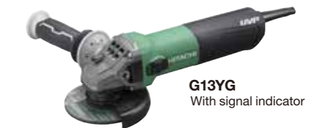
G13YG With signal indicator