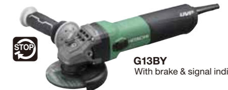
G13BY With brake & signal indicator